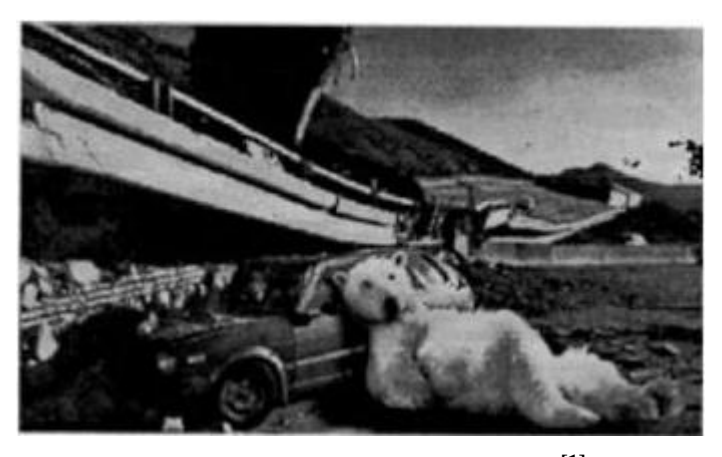
Figure 3: After Applying filter. [1]