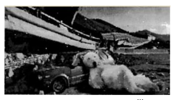
Figure 2: Before applying filter. [1]