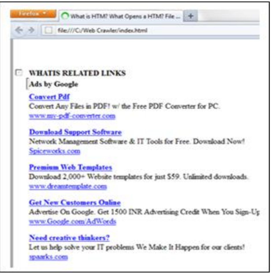
Figure 4: The output of the crawler is given below.

The architecture model is proposed for two stage crawling the pages with higher rank. The representative set of domains show the effectiveness of the proposed two-stage crawler. This achieves higher harvest rates than other crawlers. In future work, we plan to combine prequery and post-query approaches for classifying deep-web forms to further improve the accuracy of the form classifier. The requirements for external interface design are windows operating system, IDE Netbeans, Java and MySQL.