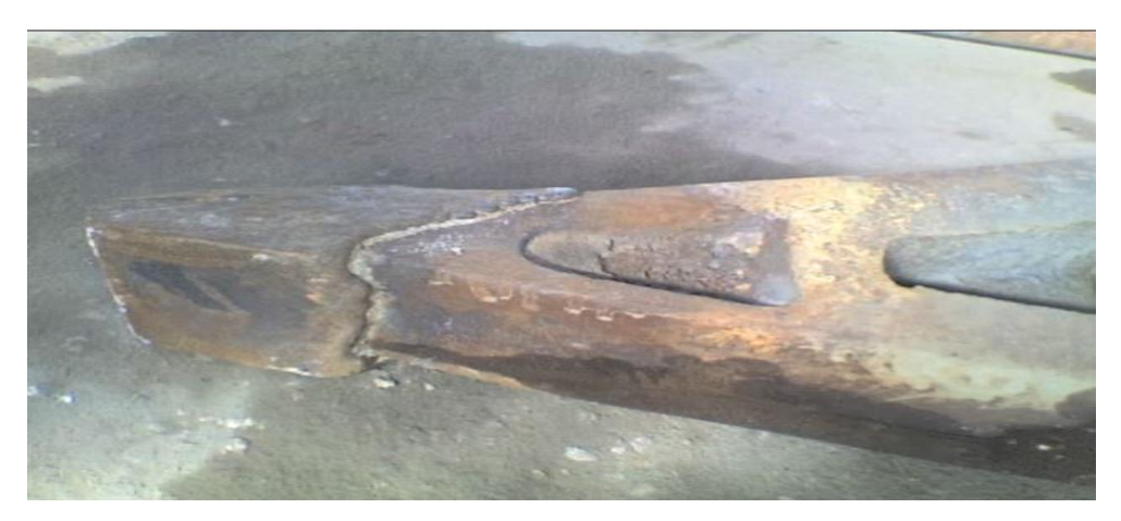
Fig. 2: General view of the teeth of steel welds 50HG.

Among the large number of different methods used to restore and harden the working bodies of excavator buckets, electro-slag surfacing (ESC) occupies a prominent place. This is explained by a number of features of the ESN, namely: the high performance and quality of the weld metal, the possibility of surfacing in a single pass of a layer of almost any thickness, the relative simplicity of obtaining a bimetallic layer or a layer of varying chemical composition. These advantages of ESN over other methods, which appear when surfacing large teeth of excavators, are especially noticeable. Due to the effectiveness of using the methods of electro slag surfacing of volumetric hardening of teeth, an experienced surfacing of worn teeth was performed. Surfacing of the teeth is made on the installation of ES in WRME in NMMC. At the first stage, 110G13L steel was selected for the consumable electrode. At the second stage - steel 50 hg. The surfacing modes remained the same as in the case of surfacing with 110G13L steel, is shown in fig. 2.