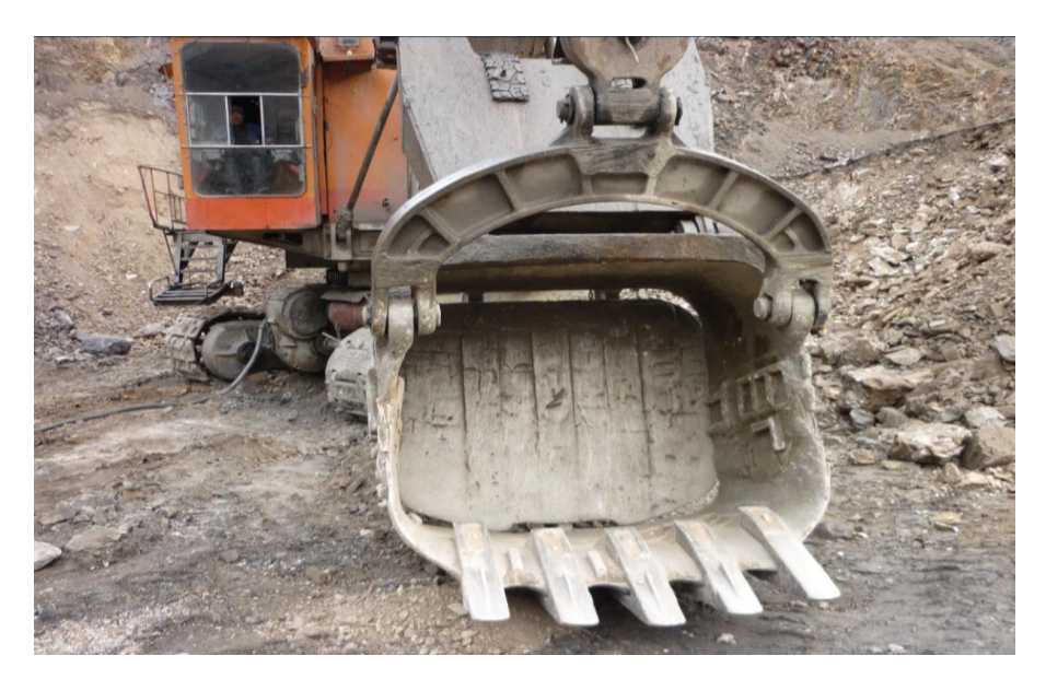
Fig. 3: General view of the front wall of the bucket with established teeth on it. CONCLUSIONS

resource compared to a standard tooth 15 to 23% more. Figure 3 shows a general view of the front wall of the bucket with the experienced teeth mounted on it.