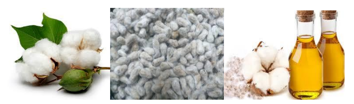
Figure 1: Cotton, seeds and oilseeds.

All species of cotton belong to the same genus: Gossipium, and belong to the family Malvaceae. The genus Gossipium includes 35 species, and 5 of them are cultural: 1. G. hirsutum (Mexican) Mexican or ordinary (medium-fiber) cotton 2.G.barbadenze (G.barbadenze) Peruvian cotton or long (fine-fiber), 3. G. herbaceum, African Asian or herbaceous cotton, 4. G. arboreum Indo-Chinese or woody cotton, 5. G. tricuspidatum, West India-three (bowl) is called toothed cotton. The last West Indian species is considered a minor species because it is morphologically close to xirzutum. Cotton, its seeds and oil products are shown in Figure 1.<sup>[1]</sup>