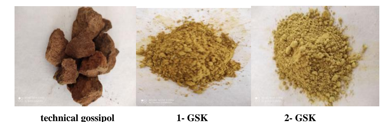
Figure 4. 1-GSK, 2-GSK formed after degreasing technical gossypol crystallization steps.

To obtain a pharmacopoeial GSK, a recrystallization process of GSK 2 was performed and the purity of GSK 3 formed after all stages was 98-99%. The appearance of degreased technical gossypol and its derivatives 1-GSK, 2-GSK is shown in Figure 4 below.