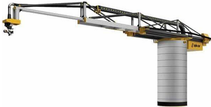
Figure 4: Crane Printer.

Nozzles-End part of the printer head that is nozzle is very important part as it forms the required shape and size of the layer. It is very necessary to have an appropriate nozzle for 3D concrete printers. It should be such that it should provide stability to each layer of concrete and avoid it from collapsing. A study by 'Kwon' states that circular nozzles are difficult to use than square nozzles. However, smaller contact surface between layers or bends may disturb stability of layers in construction.