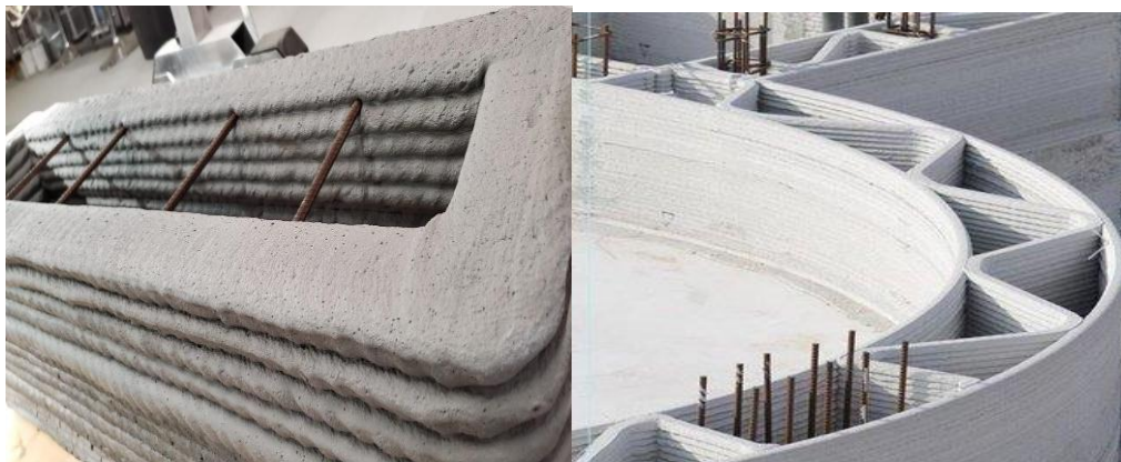
Figure 7: Reinforcement in 3D Concrete

For better structural performance and flexibility, concrete structures are added with reinforcement. In 3D printing steel bars are used in columns and beams and steel plates and small steel hooks are used in walls for stability of the wall. Steel bars are used as reinforcement in columns and 3D printed concrete layer is used as formwork and after it hardens concrete is poured in it.