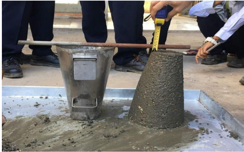
Figure 6: Zero Slum Cone Value.