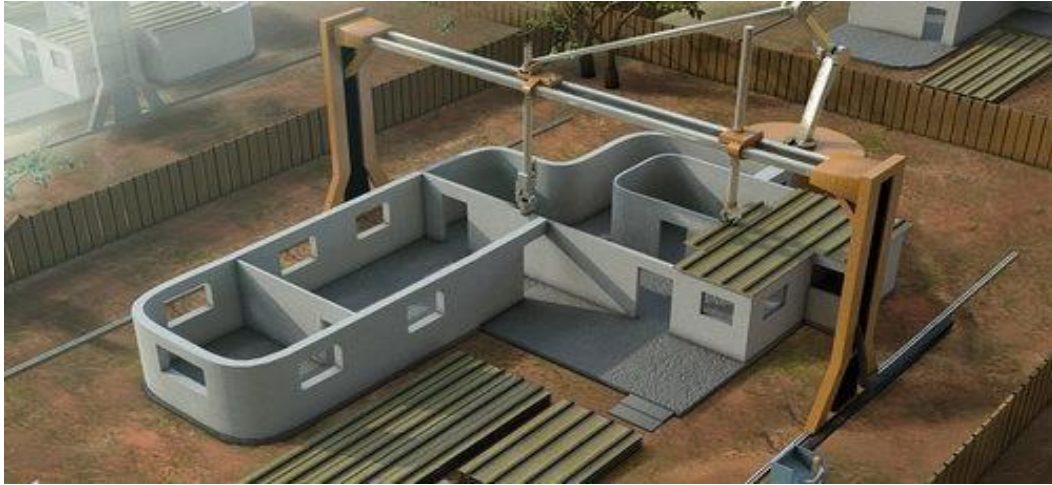
Figure 2: 3D Concrete Gantry Printer.

each other with motorized wheels which move the steel frame in linear direction. The size of gantry printers differs from small laboratory version to a large version of dimension 40m x 10m x 6.6m.