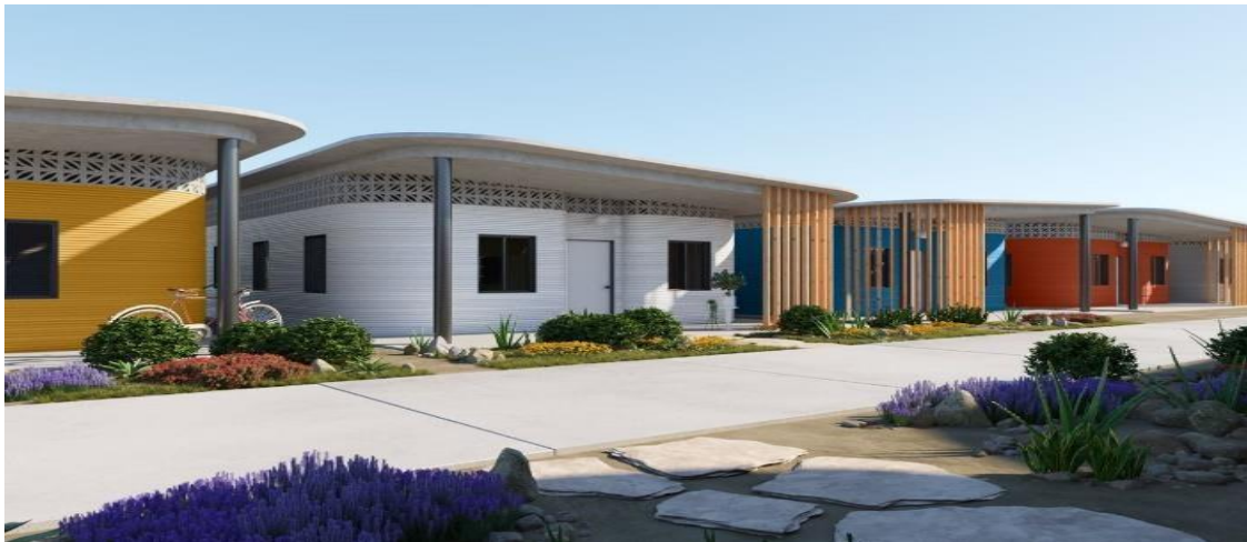
Figure 1: 3D Printed Row Houses.

Every person dreams to have his own house. Many government schemes provide houses to poor people under slum clearance or slum rehabilitation process. If they use 3D concrete printing technology then they can provide a greater number of houses in less time and at very low cost. Any house which is single stored and area is 55-75 sq meter can be constructed within 24 hours at 3 lakhs to 6 lakh INR which is very low compared to normal concrete houses with same area. 3D concrete printing can be used in government housing schemes like Pradhan Mantri Awas Yojana (PMAY) or NTR Urban Housing Schemes or Maharashtra housing and area development authority (MHADA) etc. for providing affordable houses to poor people and in very less time.